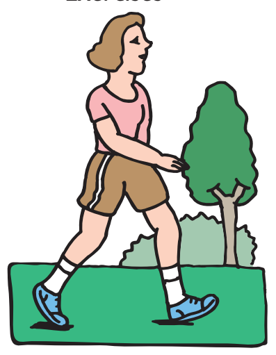
Fast walking Gardening