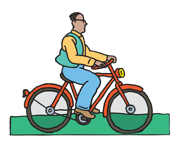
Bike riding Team sports