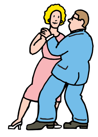
Dancing Light jogging in place